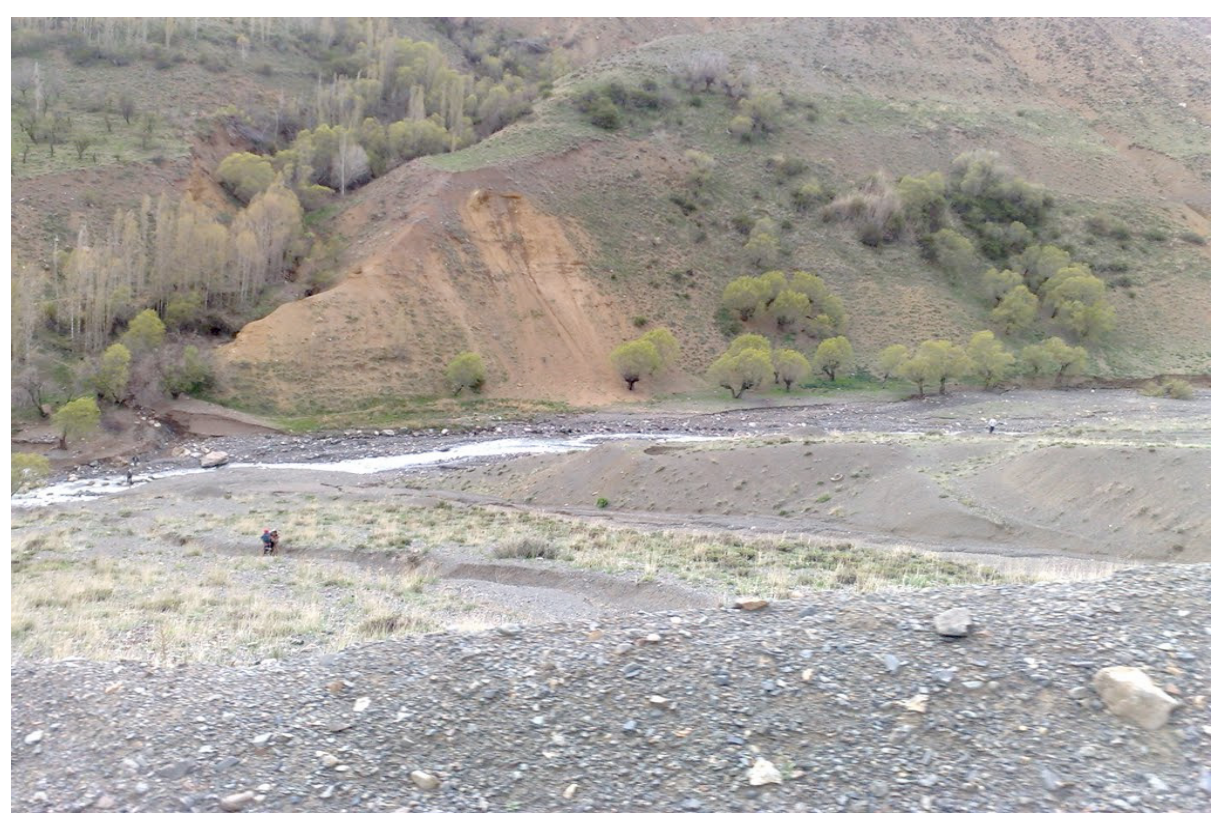
Figure 6. Daryan Village hinterlands and the Sirwan River (Alireza Solhi, 2011)

concerns in various ways over the construction of the Daryan Dam, but Iranian officials have not responded to people's requests to halt its construction.<sup>34</sup>