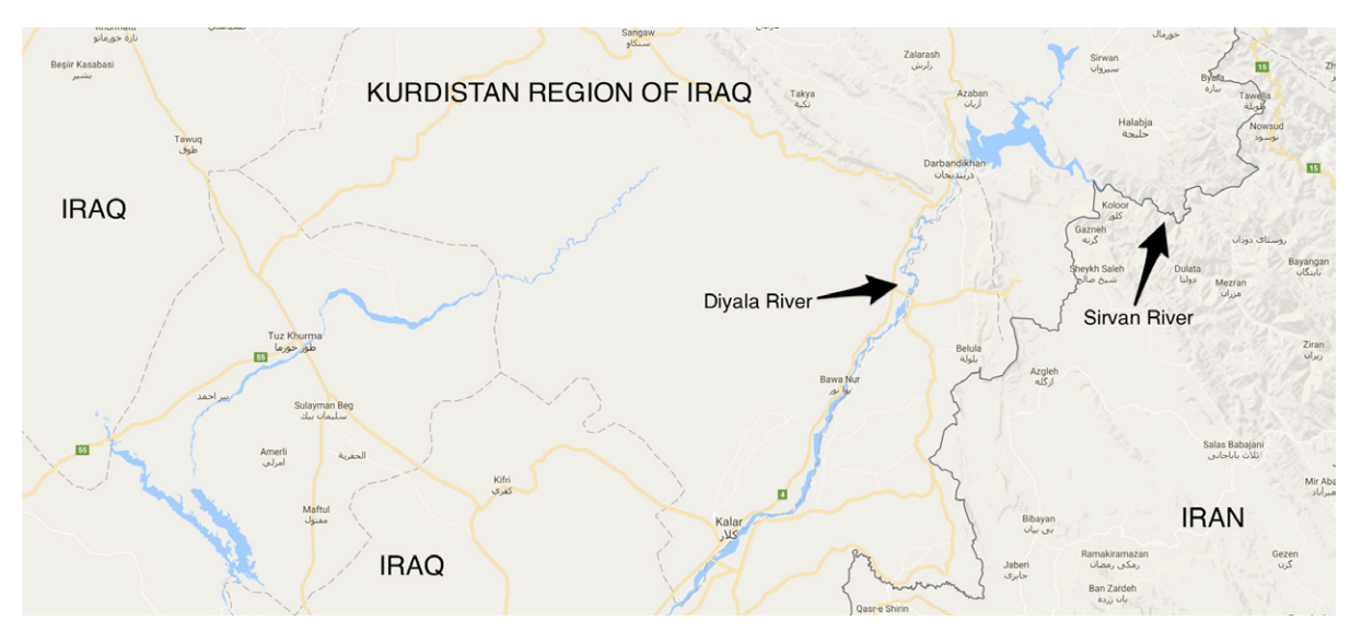
Figure 3. Map detailing the path of the Diyala River after entering the KRI

These impacts cannot be seen yet, as the water from the Sirwan River is still fully flowing to the KRI, but in the coming years, if and when the Daryan Dam comes into operation, the effects will become visible. A preview of what is to come took place on 24 November 2015, when water flows to the KRI were cut by Iran for a couple of days in order to test the Daryan Dam. During that time, the General Directorate of Water Resources in Halabjah measured a flow rate of 0,5 cubic meters of water per second. This was mostly water flowing not from Iran but from Tawelah, Griana and Hawar, areas inside the KRI. Then on 30 November 2015, when the test was over and water flows from Iran resumed, the General Directorate measured a flow rate of 2.4 cubic meters of water per second. The Chair of the Environmentalists of Halabjah Organization, Hawraman Sajadi, asserts that hundreds of thousands of people will be affected by the Daryan Dam coming on-stream: "60 percent of water flows will be cut at a time when we are in need of water more than ever. For governorates in Central and Southern Iraq, the situation will be even more catastrophic."