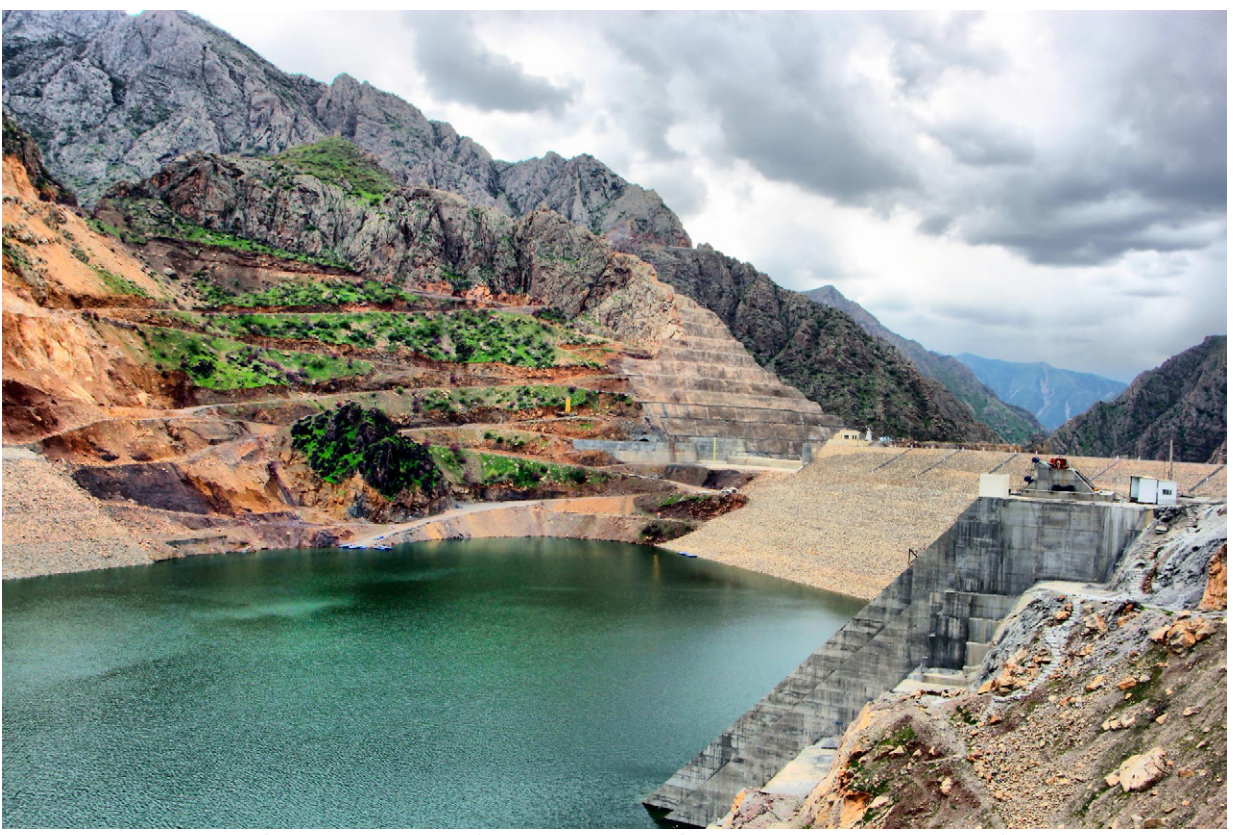
Figure 1. The Daryan Dam under construction on the Sirwan River in Iranian Kurdistan (Arash Bahrammirzaee, 2016)