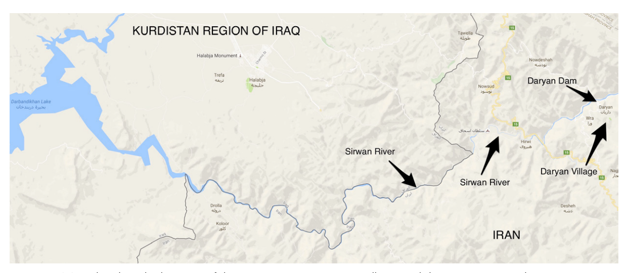
Figure 2. Map detailing the location of the Daryan Dam, Daryan Village and the Sirwan River. The river emanates in Iran and runs along the Iran-Iraq border before flowing into the KRI.

over water disputes. To date, however, these disputes remain unresolved.<sup>3</sup> In recent years, the KRG itself began constructing additional dams, which are viewed as a threat throughout the rest of Iraq. In Baghdad and Erbil alike, nationalist rhetoric is increasing, and water carries great potential to play a significant role in future disputes between the two governments. Controversially, though KRG politicians and civil activists are in opposition of the construction of dams on shared rivers in Turkey and Iran, they support the construction of dams in the KRI in order to control access to water resources flowing to Central and Southern Iraq.