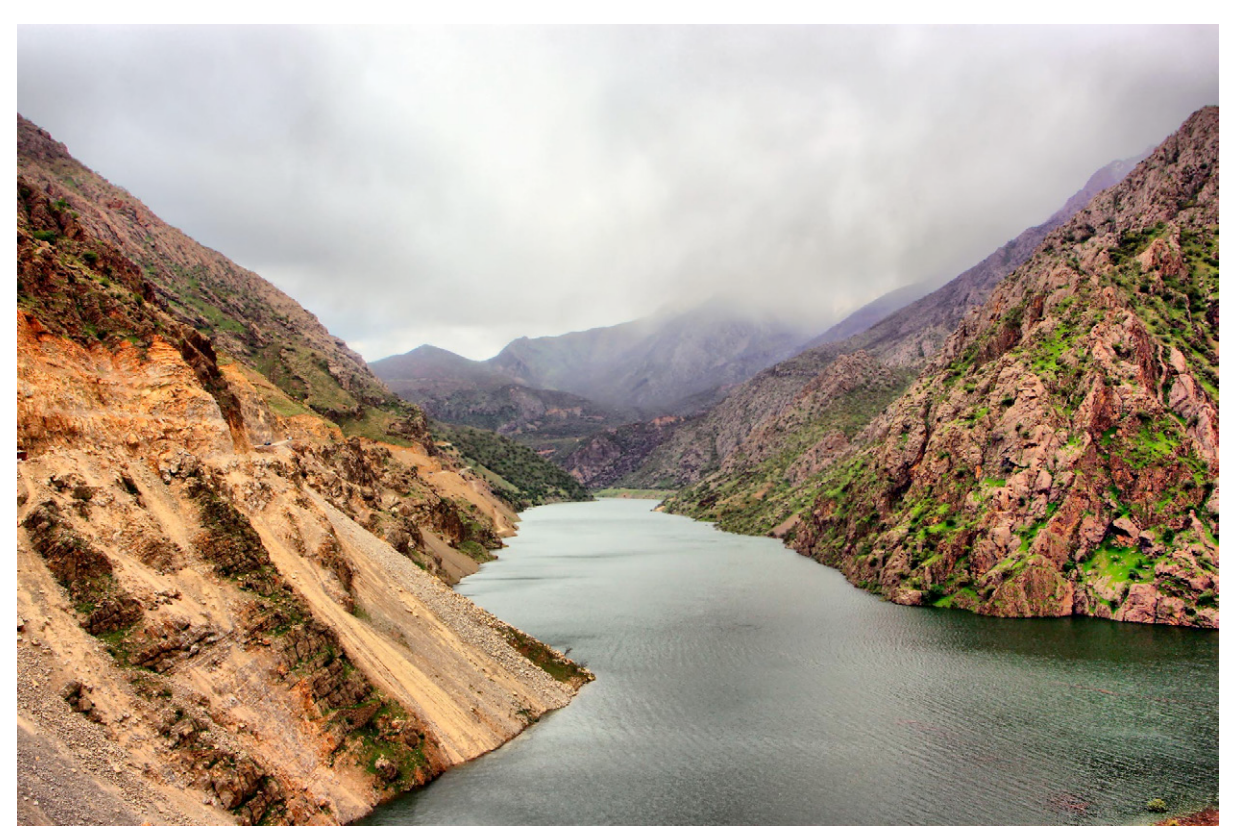
Figure 4. Downstream view of the Sirwan River from the Daryan Dam

During a visit to Erbil, I have also requested from the Iraqi government's Minister of Agriculture and Water Resources that the Iraqi government should put pressure on Iran, as the Sirwan (Diyala) River also flows through parts of Iraq outside of the KRI. Iraq has good ties with Iran, and therefore they should be able to exert pressure on the Iranian government. The Iraqi minister said he would address the issue with Iran.<sup>29</sup>